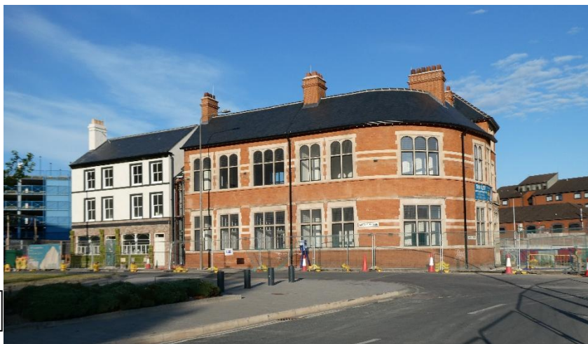
Earl de Grey & Castle Buildings

OLD TOWN / CITY CENTRE - 25/00810/FULL Q06 Simon Mounce 612920 Various Streets, See Description Engineering works involving excavation to facilitate laying of below ground insulated hot water flow and return pipes for Phase 1B of the Hull District Heat Network. (This application covers Land along Portland Street, Spring Street, Lombard Street, part of Ferensway, North Street, part of Prospect Street, Albion Street and Albion Square, Jarratt Street, Bond Street and part of Jameson Street, part of Cleveland Street, Drypool Bridge beneath the bed of the River Hull, part of Alfred Gelder Street, land at Hull College, part of Charlotte Street, part of Freetown Way, Wilberforce Drive, part of North Walls, part of Lowgate, Guildhall Road, part of Hanover Square, part of Queens Dock Avenue, Carr Lane, Anne Street, part of Myton Street, part of Osborne Street, part of St. Luke's Street, part of Pease Street, Cambridge Street, part of Icehouse Road and part of Great Thornton Street.)