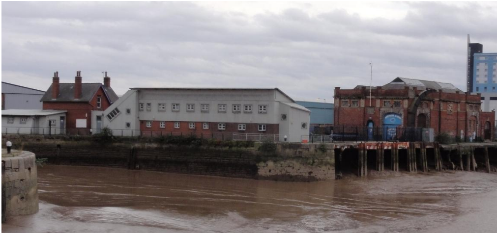
Dock House and extensions (to the left of the picture)

Dock House St Peter Street HU9 1AF Ref. No: 25/00346/FULL Status: Application Permitted