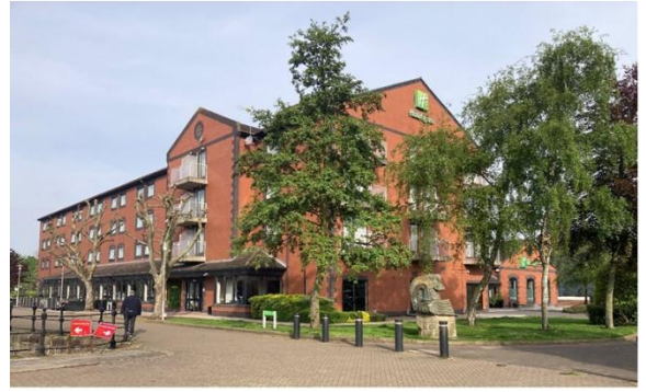
Holiday Inn at the Marina (from planning documents)

MARINA - Holiday Inn Castle Street HU1 2BX Ref. No: 24/01025/FULL | Status: Application Permitted