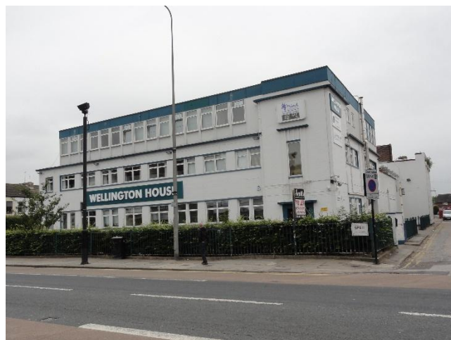
Above: Wellington House, Beverley Rd Left: Aerial view (from planning documents) of the proposed MIND development behind Wellington House.

Erection of two-storey administration facilities building abutting the rear of Wellington House, a terrace of three single-storey supported living apartments, and one detached single-storey supported living apartment, including landscaping vehicle parking, and boundary treatments.