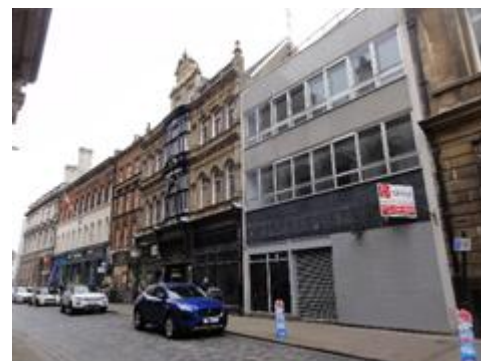
Former Royal Bank of Scotland, Silver St

OLD TOWN - Royal Bank of Scotland 9-11 Silver Street HU1 1JE Ref. No: 25/00275/FULL | Status: Application Permitted