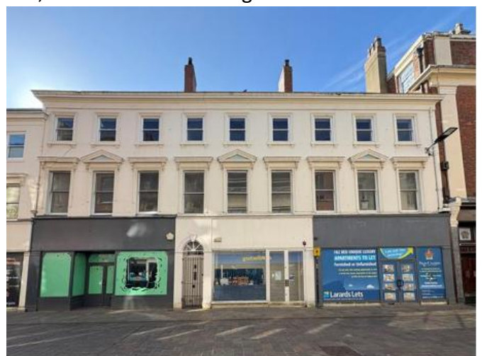
21,22,23 Whitefriargate (from planning documents)

1) Change of use from Care Home (C2 use) to a single 15-bedroom House in Multiple Occupation (Sui generis HMO); 2) External alterations in connection with proposed change of use (existing window changed to a door).