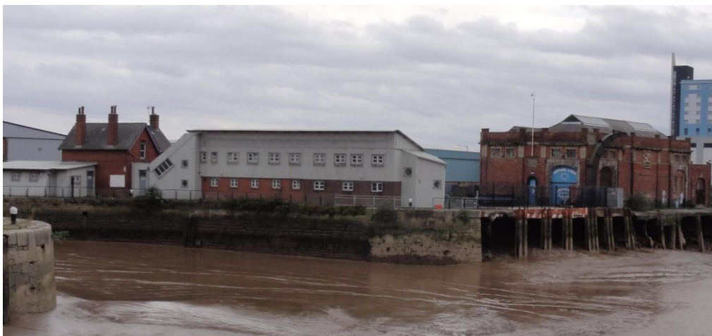
Dock House and extensions (to the left of the picture)