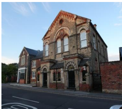
Left: Masonic Hall, Sutton Right: Craven Park, Preston Road.