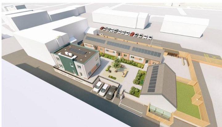
Aerial view of the proposal

Left: Aerial view (from planning documents) of the proposed MIND