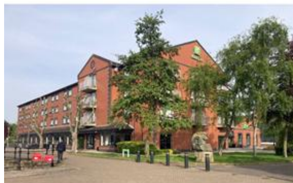
Holiday Inn at the Marina (from planning documents)

MARINA - Holiday Inn Castle Street HU1 2BX Ref. No: 24/01025/FULL | Status: Application Permitted