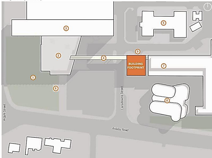
Existing Site Plan (Micro Scale)

Erection of four storey new build office and theatre recovery block which will accommodate a discharge lounge with supporting clinical spaces, a mixture of open plan and cellular office type accommodation with some meeting rooms and break out space, a well-being and management suite and a roof top plant room.