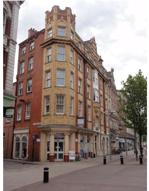
Above: Hull Dental Access Centre Below: 10-12 Lime St, seen from North Bridge

Dock House St Peter Street HU9 1AF Ref. No: 25/00346/FULL Status: Application Permitted