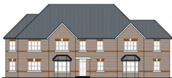
PROPOSED FRONT ELEVATION FACING HESSLE ROAD