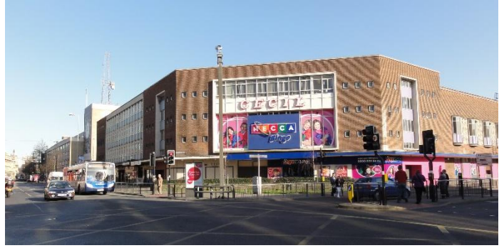
Above: former Cecil cinema / Mecca Bingo to become Calvary Church. Left: Trinity House Buoy Shed (1902)

WEST - 9B Anlaby Road HU1 2NR (former Cecil Cinema / Mecca Bingo) Ref. No: 25/00459/COU | Status: Application Permitted