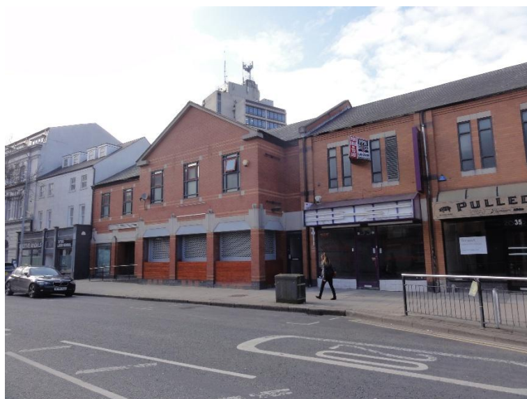
Building that include 29-31 George St

1. Change of use of highway (area of footway to north side of George Street) to external seating area. 2. External seating area to front, involving construction of raised platform with railings and installation of retractable canopy. 3. External seating area to rear, involving construction of raised platform and installation of retractable canopy.