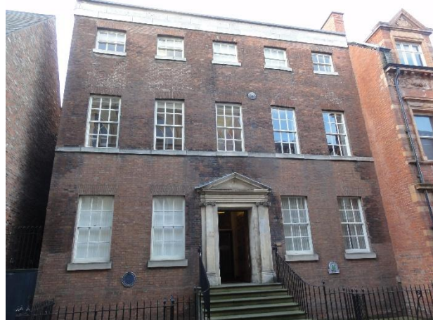
Maister House exterior (left) and lantern (right)

Listed Building Consent for: 1. Replacement of decayed timber and glass lantern with new (concealed) steel framed lantern structure with new fixed timber casement