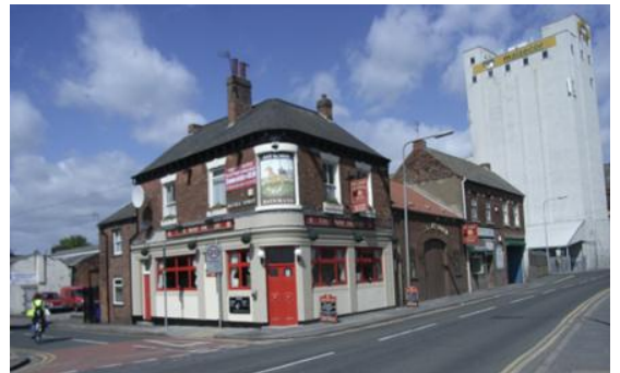
The former Bay Horse 119-121 Wincolmlee in 2009

Change of use of buildings from offices (Use Class E) to independent specialist school (Use Class F1 Part A) Removal of section of boundary wall between 119/121 Wincolmlee and 80 Scott Street and installation of new door in south elevation of no. 80 Scott Street to provide link between the buildings.