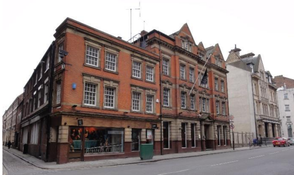
Above: 33 Lowgate. Left: 97 Spring Bank

OLD TOWN - 33 Lowgate HU1 1EA Ref. No: 24/01063/FULL | Status: Application Permitted