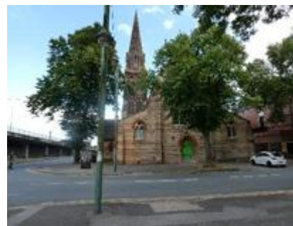
Left: Masonic Hall, Sutton; Above: St Matthews.