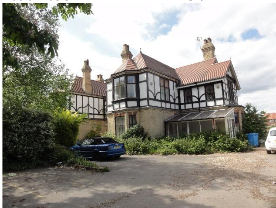
Left: 2058 Hessle [High] Road. This was one of a group of houses built to accommodate children who would otherwise have had to live in Sculcoates Union Workhouse. Below: approved new flats on the site.

Erection of a two-storey building to provide 8 flats with associated parking and amenity space 2056-2058 Hessle Road HU13 9BF Ref. No: 25/00060/FULL | Status: Application Permitted