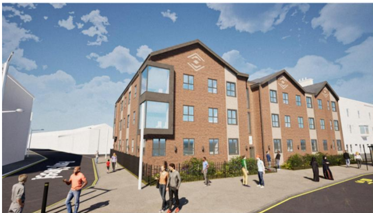
Left: buildings at 423-429 Anlaby Rd before demolition in 2008. Right: proposed new flats on same site.