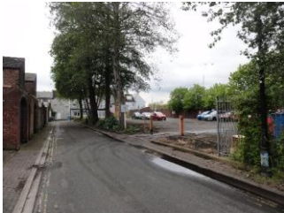
Left: Egginton St – proposed site of flats