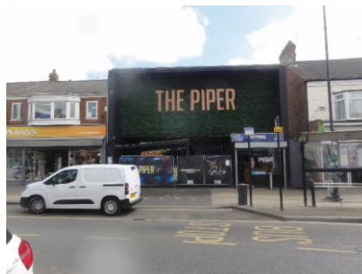
The Piper Club, Newland Ave

Change of use of night club (Sui-Generis) to place of worship (Use Class F1(f))