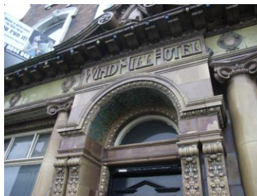
Above: Windmill Hotel, Witham Below: 161 High St

Application for Listed Building Consent for works to the pub and accommodation: 1. Retention of altered pub bar, with optics and shelving, in its new location. 2. Works to bar area, including reinstatement of original serving hatch and privacy screen and replica door to bar side with replacement architrave. 3. Works to entrance hall, including boxing-in electrical meters, installation of suspended cable trays and conduit, removal of unauthorised metal drylined walls and making good to architrave, skirting and dado rail. 4. Installation of glazed fire doors installed within the flats and installation of 2x original doors at first floor, whilst storing the rest indefinitely. 6. Reinstatement of coving to Flat 2 on the first floor. 7. Retention of lowered ceilings and over skimmed ceilings to flats. 8. Removal of vinyl signage to ground floor north side pub window. (Part-retrospective)