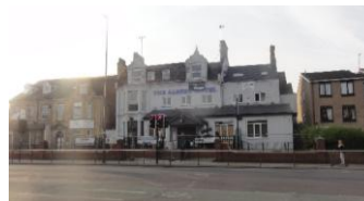
Above: The Albert Hotel, Anlaby Rd. Below: Hardakers building Beverley Rd

WEST - The Albert Hotel Public House 394 Anlaby Road HU3 6PB Ref. No: 25/00131/FULL | Status: Approved subject to Section 106