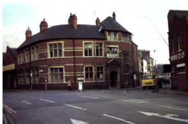
Castle Chambers in 1973

(Sadly, my camera battery gave out just as I tried to take a photograph of today's scene!)