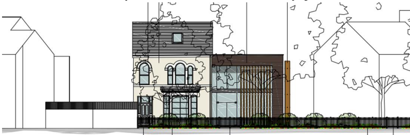
Above: Proposed side extension to Al Salaam Mosque. Below: Al Salaam Mosque, Boulevard on 6.1.24

Boulevard: In w/c 18/12, there was an application to add a two-storey side extension and a single-storey rear extension to the Al-Salaam Mosque at no.153 to 157, with associated landscaping works.