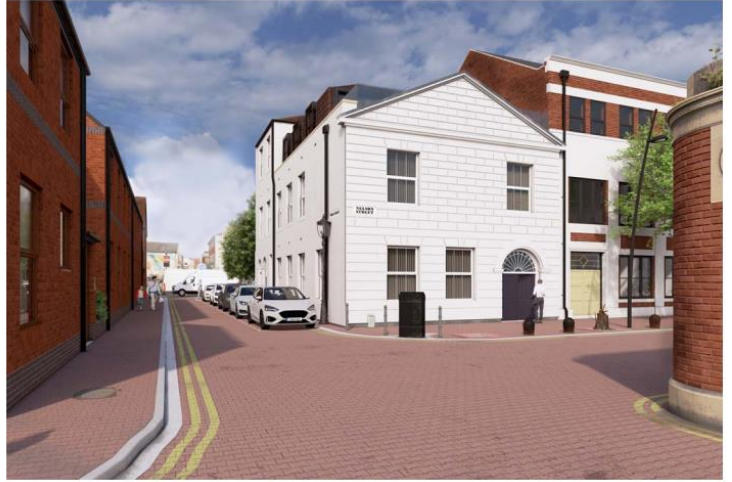
Left: The Counting House on 25.1.19 (JDS) Right: Proposed view with 2 nd storey extension (Planning Documents, Application 23/03491/FULL)

While retention of the pediment is a real improvement to the hideous proposals submitted in February 2023 and refused in May (see the elevations below), the December 2023 version would still alter the character of the building.