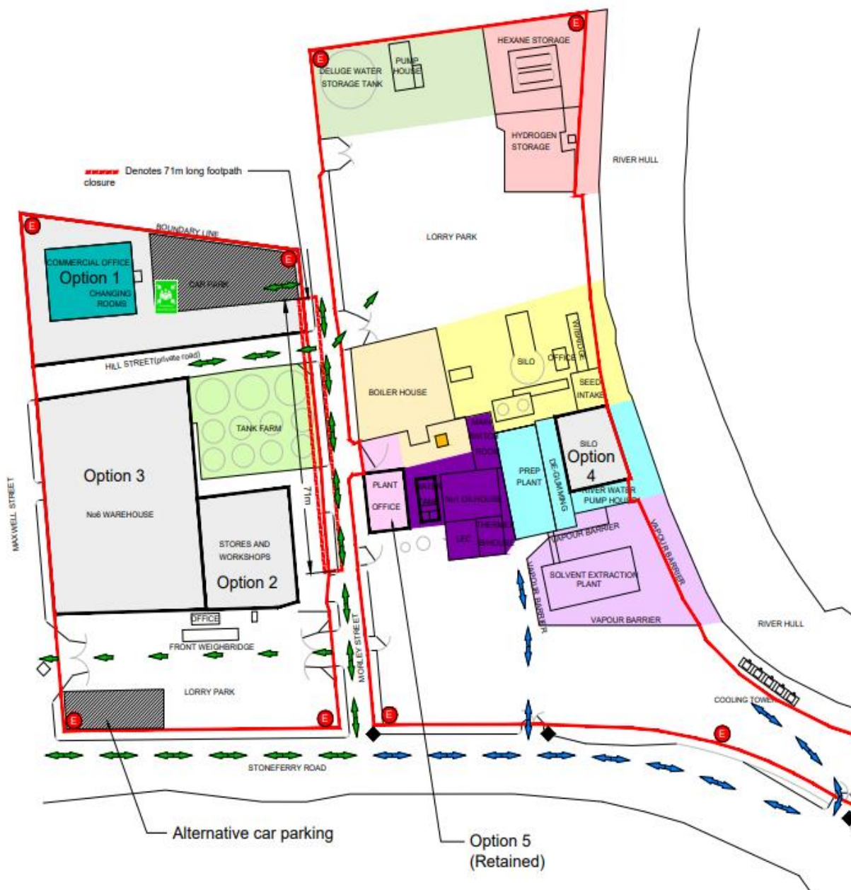
Above: Layout of Cargill UK's Isis Oil Mill.