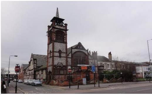
Left: Trafalgar St Church and 53-55 Beverley Rd

As part of the Beverley Rd Townscape Heritage Scheme, new boundary treatments (wall & fencing) were approved in w/c 11/12 for the former Trafalgar St Church (no.49-51) and the listed houses at 53-55 (Ref. No: 23/03315/FULL).