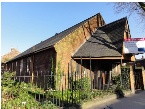
Above: proposed layout and elevations (from planning documents) Left: Newland United Reform Church on 8.4.2011, after closure.