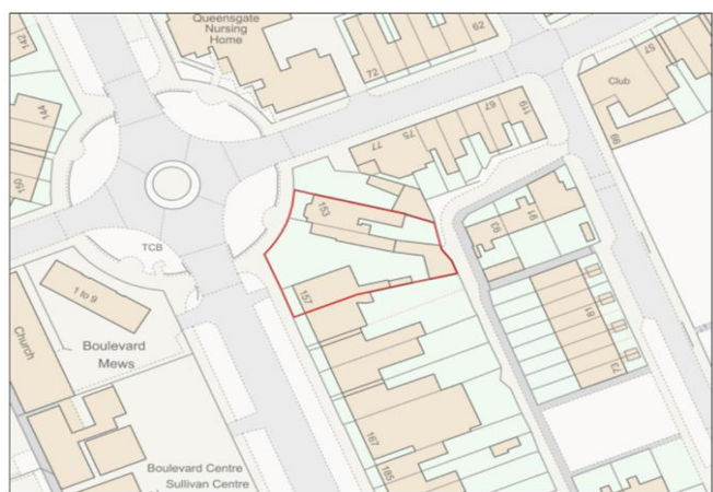
Left: Location on Boulevard