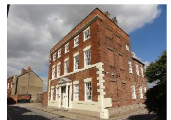
Blaydes House, High St