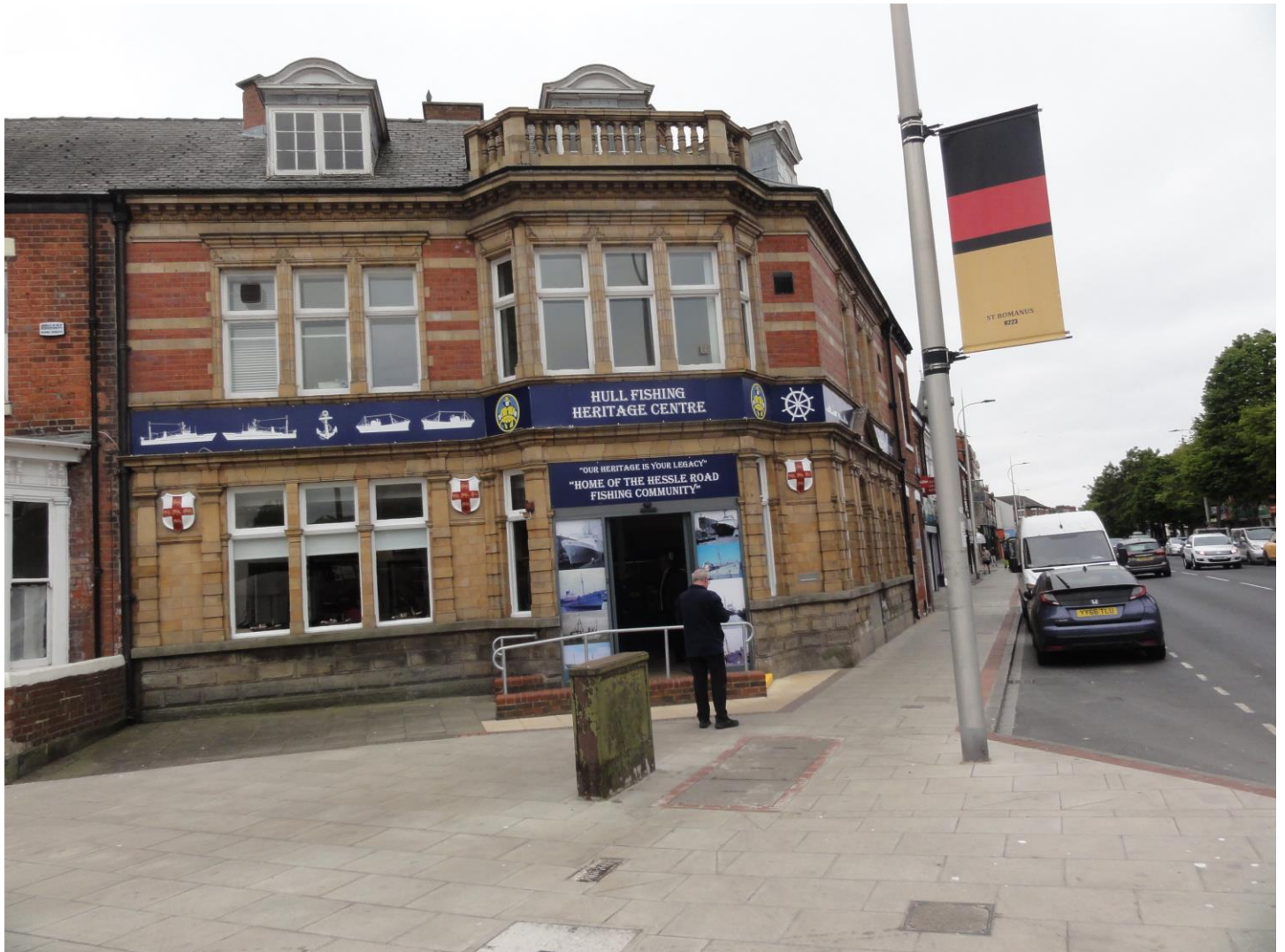
Former Barclays Bank, Hessle Rd – the new home of Hull Fishing Heritage Centre