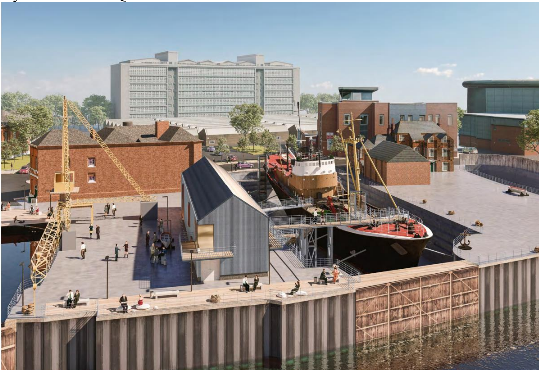
Design Development - Aerial View of the Proposed North End Shipyard Stage 3 Scheme. (Gangways not as final proposal)

Proposed revision to rotate the Arctic Corsair so that the bow will be facing the River Hull