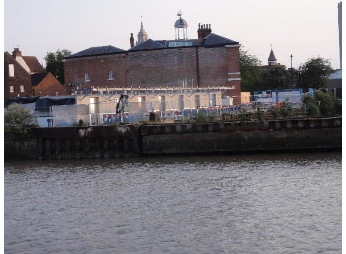
Above left: Queens Gardens from Hull College 20.6.13