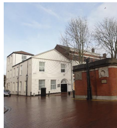
Above: The Counting House (the white building) Below: 3 Kingston Square

01) The proposed rooftop alterations and extension would appear alien and dominant and would appear as a discordant feature within the context of this building and would harm the character and appearance of the Old Town Conservation Area and the settings of the neighbouring /nearby Listed buildings. Contrary to Local Plan Policies 14 and 16 and the guidance within the NPPF.