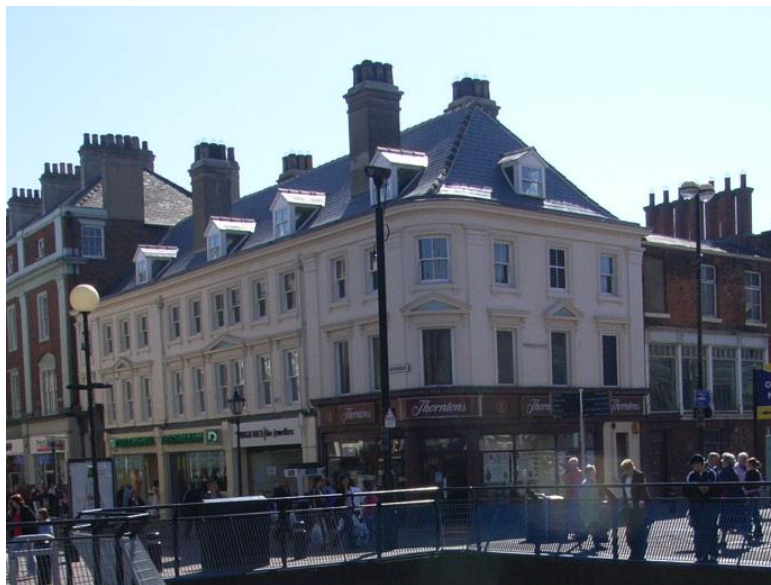
33 Whitefriargate (former Thornton's shop)

Change of use of land for caravan storage (1.5Ha)